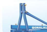
Robust 3 Point Linkage